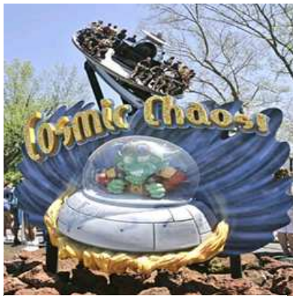
Cosmic Chaos

This year Kennywood debuts a new ride called the Cosmic Chaos. The ride goes back and forth while spinning; the car is shaped like a flying saucer. Students from the journalism classes and the T.V. production club got the chance to experience the ride on Friday while attending Media Day held at the park. The new ride took the place of the Magic