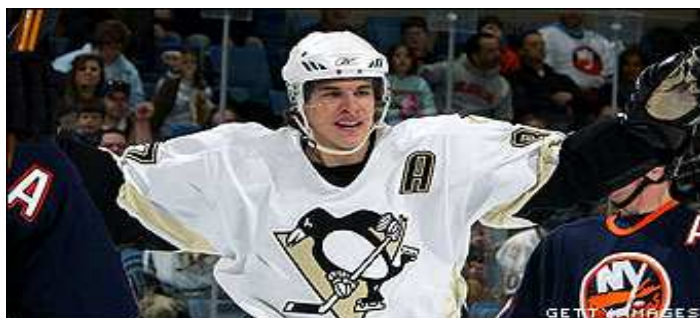
Penguins Art Ross winner Sidney Crosby www.tsn.ca

The Pittsburgh Penguins wrapped up their tremendous season with a disappointing 4-1 series loss to the very talented Ottawa Senators. The main difference in this series was the difference between the qualities of each team's defensive core and the Penguins lack of production on the power play. The Pens lack of experience in postseason play also hurt their chances against a veteran Ottawa team.